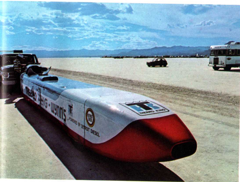
An experimental 3500 horsepower diesel-powered car needs a long push start.